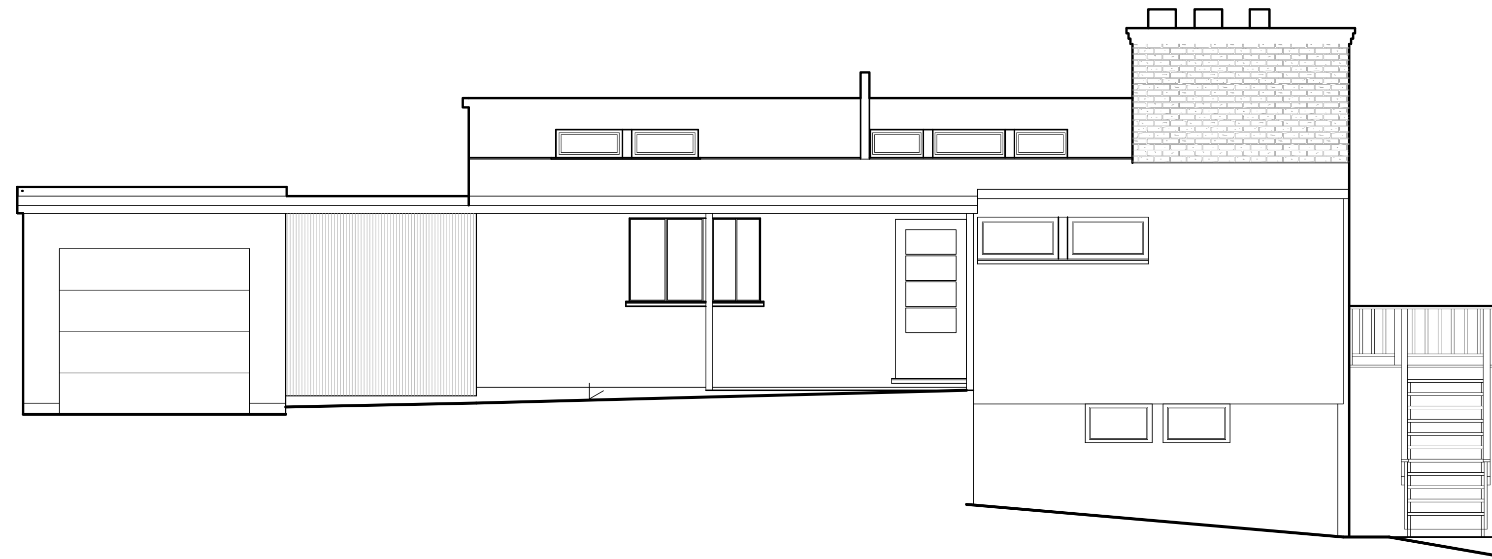
5 ELEVATION C (FRONT) SCALE 1/4" = 1'-0"