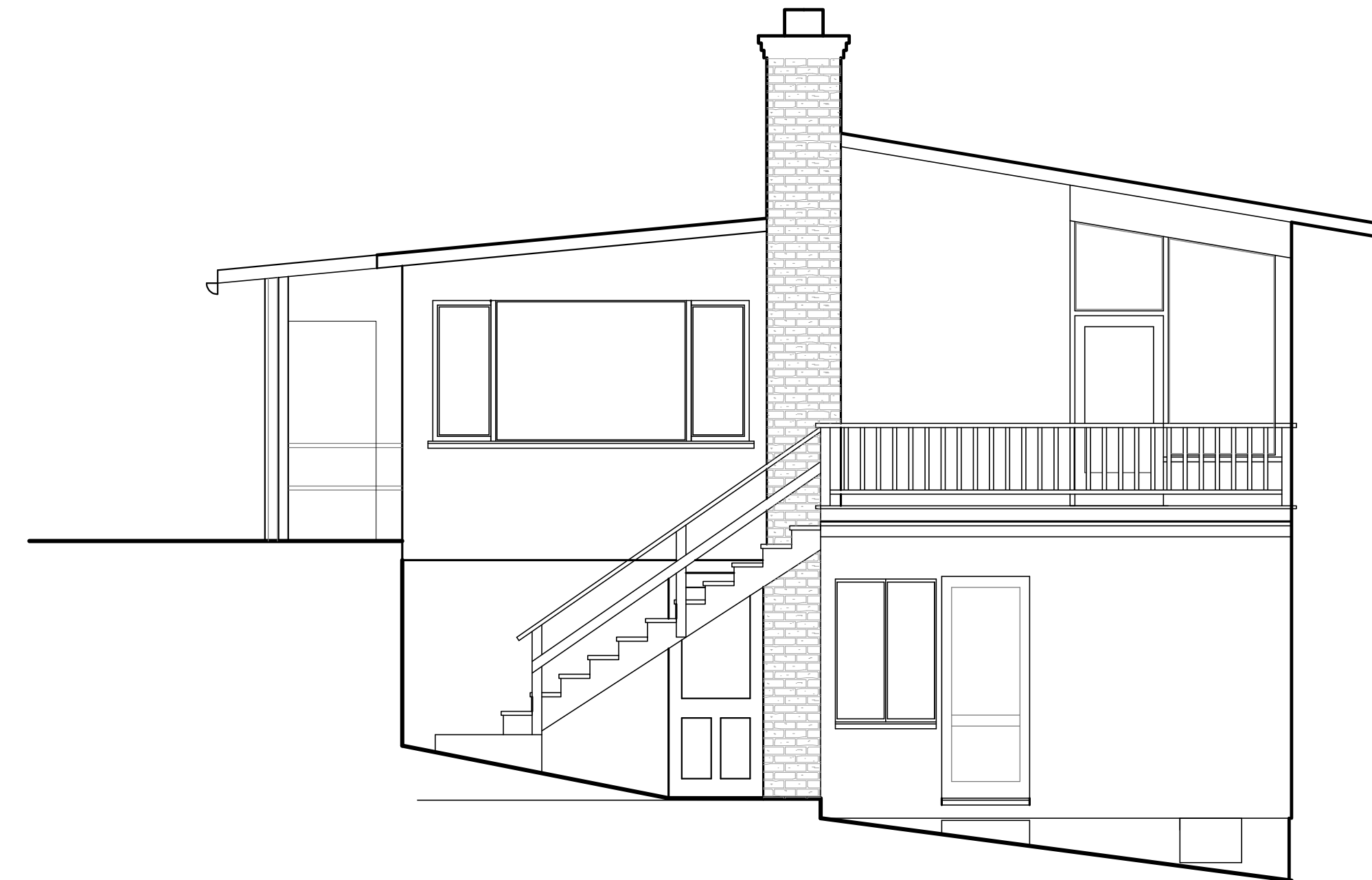
4 ELEVATION B (RIGHT) SCALE 1/4" = 1'-0"